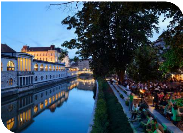
Ljubljana

The ghosts of the past also haunt Celje. Like Ptuj, the city's image was shaped by antiquity and the Middle Ages. In Celje, an imposing city below today's town, discover the remains left underground by the ancient Romans. You can explore the turbulent Middle Ages above the city, at the mighty Old Castle of Celje. Built on a steep rocky hilltop, it has been tracing the development of the town since the 12th century, and its fate has been influenced by the family of the Counts of Celje. The most important noble family in what is now Slovenia has left many stories in Celje and its surroundings, in addition to the buildings.