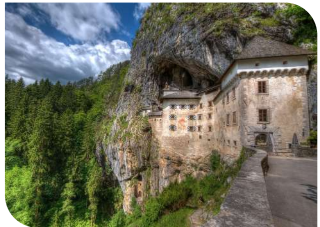
Predjamski grad (by Alan Kosmač)

Ljubljana Castle, a magnificent landmark in the capital, could also tell a story or two. For centuries, it has watched the hustle and bustle of the city below and even beyond its borders. Climb its tower and enjoy the same view. Explore its interior, which continues to surprise visitors with new discoveries and new ways of understanding the past. The path from the castle leads you to the Old Town, located between the castle hill and the Ljubljanica River. A walk along the cobbled streets, past buildings that have stood there since the Middle Ages, takes you across the Three Bridges (Tromostovje), designed by architect Jože Plečnik, among many other landmarks.