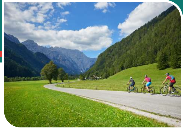
Logarska valley