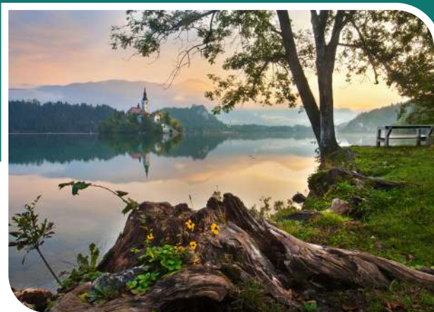
Lake Bled (by Jošt Gantar)