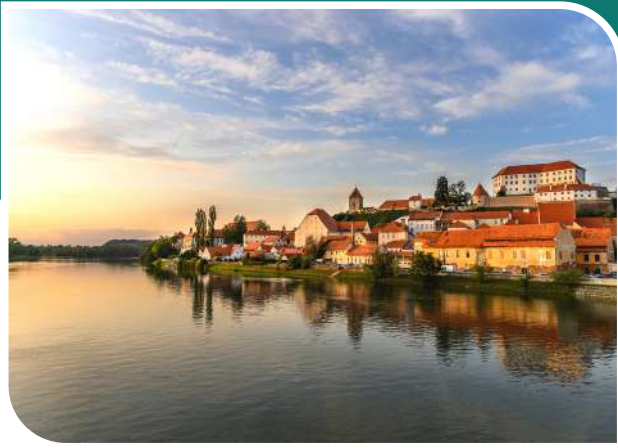
Ptuj