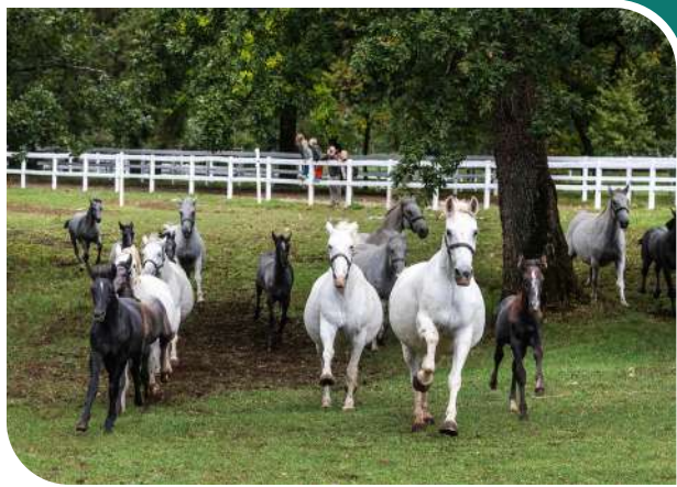
Lipica